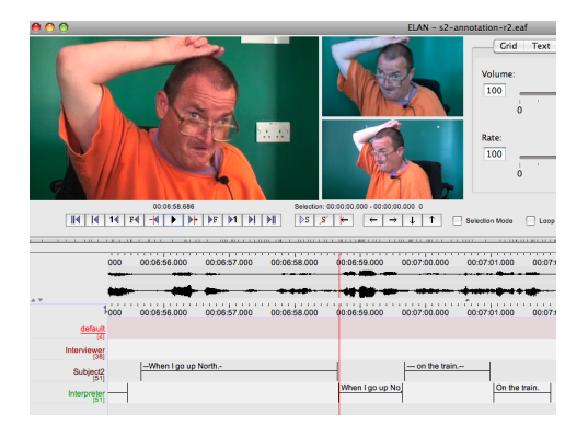
Fig. 1. A screenshot of the ELAN annotation tool [66], which we used to annotate the interview.

During the interview sessions, three cameras were trained on the interviewee. One camera directly faced the subject, and the other two were placed on the left and right about 2 meters away, at a 45 degree angle [57]. We also used a Tobii infrared