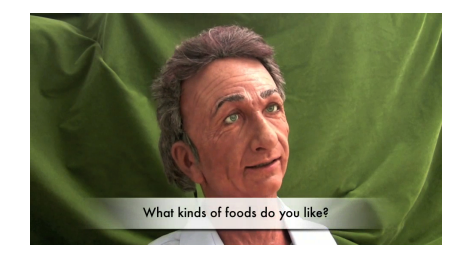
Fig. 2. A screenshot from the stimulus video, depicting an "ice-breaker" question the participant is primed to ask.

We then had an eight-minute long video consisting of two parts. We used this to create two stimuli videos for our experiment. The first video, Video 1, consisted of the entire eight-minute long video of S2 (both Part I and Part II). The second video, Video 2, consisted of Part I depicting our robot "playing back" S2's head movements and facial expressions (4 minutes), followed by the original Part II video (4 minutes).